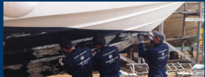
Skidanje naslaga do gealcoata Removing of the layers to gelcoat