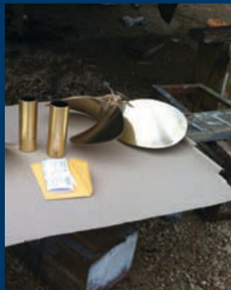
Balansiranje propelera i zmjena ležajeva Propeller balancing and bearing replacement