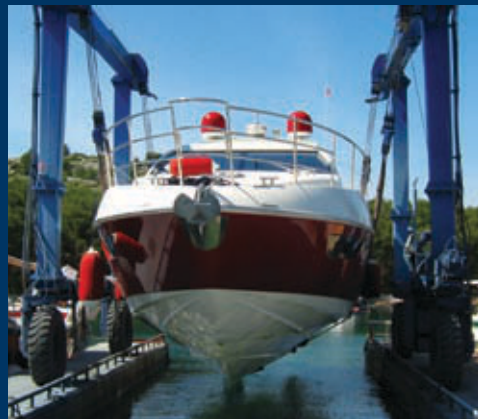
Vađenje i spuštanje plovila travel liftom Taking the boat out and putting it in the water with the travel lift