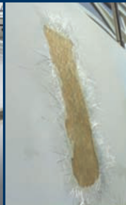
Poslije popravka After the repair