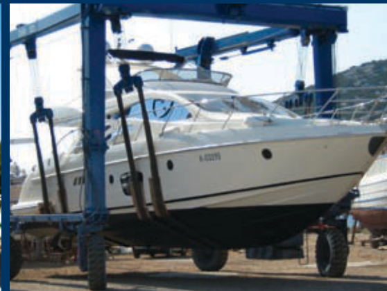
Spuštanje broda Putting the boat into the water