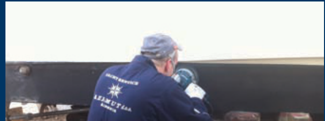
Matiranje podvodnog dijela Making of the underwater hull matt