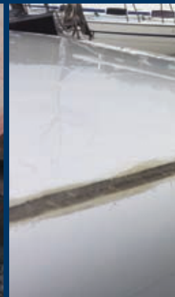
Popravlak oštećenja Damage repairs