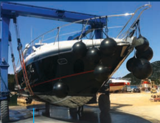
Dizanje broda taking the boat out of the water