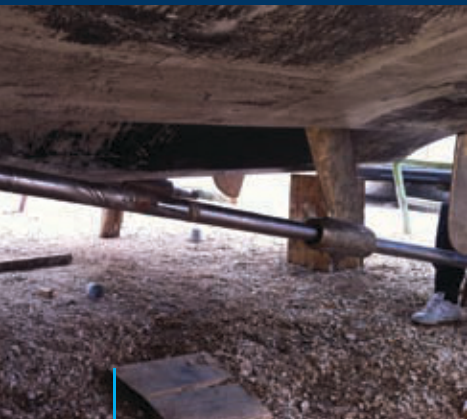
Vađenje osovina Taking out of shafts