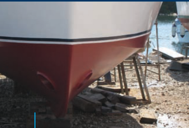
Poslije ugradnje After the installation