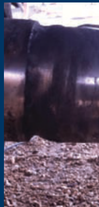
Utvrđivanje oštećenja Damage identification