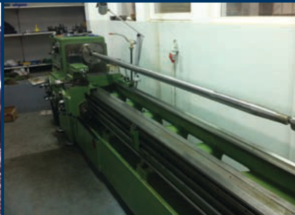
Strojna obrada osovine Mechanical processing of shafts