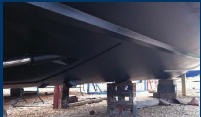
Nanošenje antifoulinga Antifouling coating