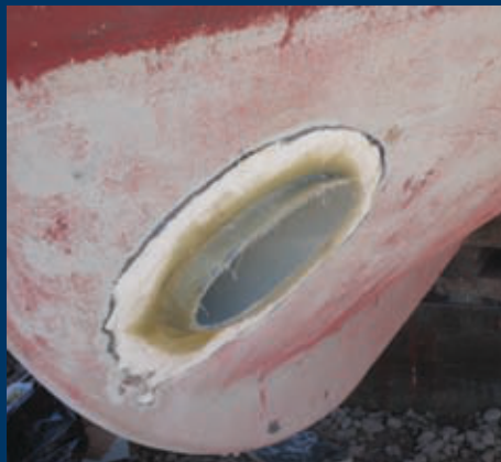
Ugradnja boathrustera Boat thruster installation